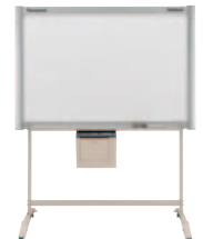
UB-5325 2-Screen Standard size