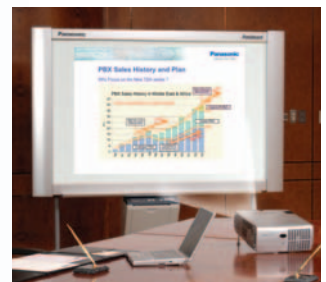
1 Screen can also be used for the Projector. (UB-7325)

Panaboard function just like operating the Panaboard control panel.