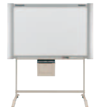
UB-7325 4-Screen Standard size (Stand option)