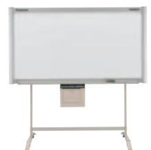
UB-5825 2-Screen Wide size